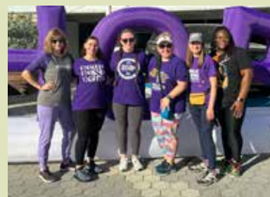
The Annual Walk to End Alzheimer's has become a Senior Connection Center tradition.