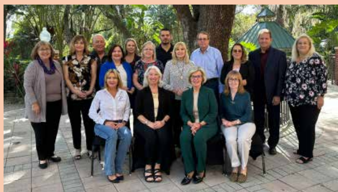
Senior Connection Center board directors and senior staff strategize our future at our November 2023 planning retreat.

This year's Nonprofit Leadership Conference provided a great opportunity for staff to enhance their knowledge while networking with other nonprofit professionals.